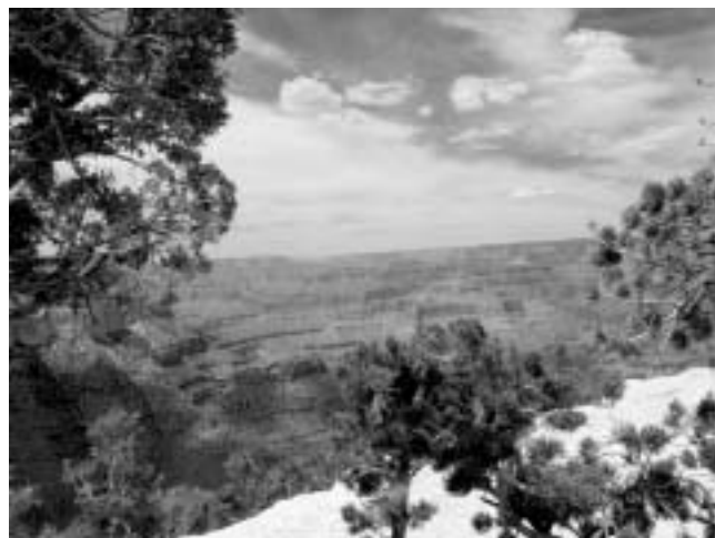
Grand Canyon Scene