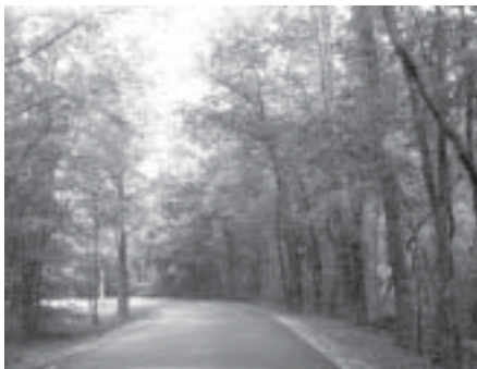
Yes, back in the woods!

What made it news-worthy to me was that we were able to do a lot of meditating when we were back at the campground, thanking God for our lives and for the lifestyle we have. The